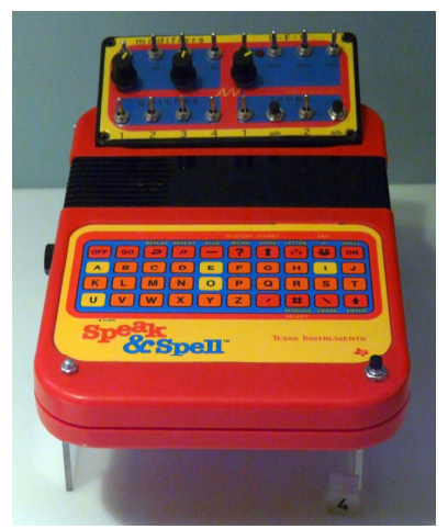
Figure 3 – A Circuit-Bent Speak & Spell, as exhibited at the London Science Museum. Switches, buttons and potentiometers have been added to the device, controlling the modifications made to its circuits.

Where circuit-bending opens up a plastic case to access electrical connections, in code-bending [54], the internal API of open-source software is re-purposed, so that instead of fulfilling its originally intended internal function, it is used for external communication. While internal interfaces are not usually accessible in closed-source programs, with open-source software, one can figuratively "lift the lid" to experiment with these interfaces, even if the APIs are not fully documented. Existing software can thus, in a comparatively rapid, playful manner, be repurposed, encouraging an explorative approach to implementation.