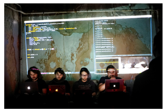
Figure 2 – Benoit and the Mandelbrots, from the Supercollider Symposium 2012 "Livecode Evening": "Codefaced people hacking music live in front of your eyes. Live coding is a new direction in electronic music and video: live coders expose and rewire the innards of software while it generates improvised music and/or visuals".

Perhaps uniquely to live-coding, this programming practice is not carried out with the ultimate goal of realizing some design outcome, but is instead a continuous performance, with the journey itself being the principal intended outcome. To stress this point, early live-coding performers often ended their acts by purposefully breaking what they had created: inserting faults into their code, which crash, disrupt or delete their program, ideally producing interesting visual and audio glitch effects as it dies.