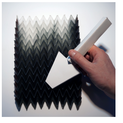
Figure 5 The speculative Select tool used for programming a shape-changing material.