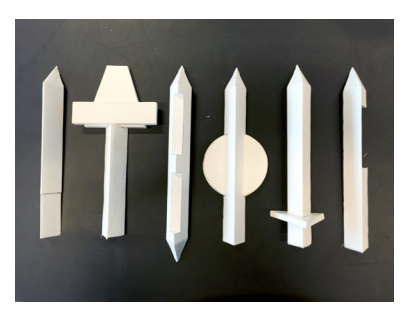
Figure 1 Speculative tools for material programming.