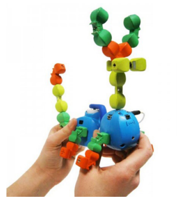
Figure 4 Programming by example: Topobo being programmed [7].