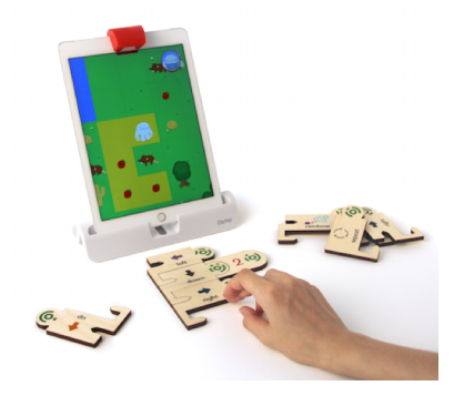
Figure 3 Tangible programming: Strawbies [5].