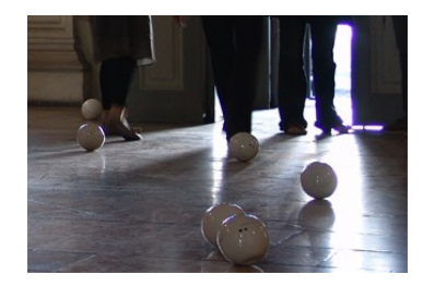
Figure 3. Beyond software control: "The Storm & 6 bands" by Jack Pavlik, and "The Search for Luminosity", by Allison Kudla, and Unrund by Korinna Lindinger.

The artists effectively balance the physical-digital by letting more of the behavior be controlled by the physical part of these materials. For instance, rather than focusing on getting speakers to make certain sounds, the materials could be acknowledged to have their own distinct voices. These properties were considered in several dimensions: "the shape directly corresponds to... to what you hear, and the movements you see" (Unrund).