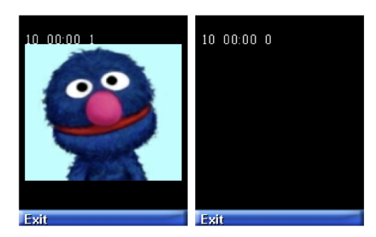
Figure 1. BluePete; on the left a device having him and on the right a device about to get him (being this close)

Bluetooth and also in order to show how it can be played with that the Bluetooth technology needs two clients to be in different modes in order for them to find each other. In this quickly implemented game searching devices "carry" BluePete and listening devices are in danger of "catching" him, which can happen when the two devices are close enough, see Figure 1. Playing this game allows a design team to experiment with the relationship between proximity, connectivity and exchange (e.g. sneaking up on someone, physically hold on to them or taking their phone). Playing the game also allow all parties of an multidisciplined design team to think of new ways of exploiting these Bluetooth properties and other scenarios where the properties might add to the experience of a system's design.