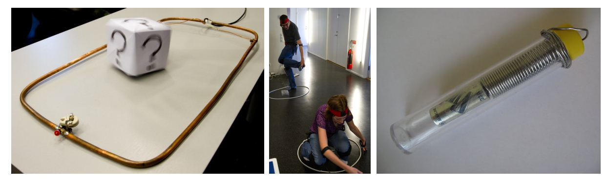
Figure 2. The diZe – a playful presentation of the reading angle of RFID; BendID – a bit where the user wears tags over her whole body; A mechanical model of an accelerometer showing how gravity always is a factor

To emphasize the diversity of the bits we have built, before continuing we also want to briefly mention BendID. BendID is a game that aims to break away from the conventions of handheld technologies and, in the case of RFID, the common assumption of one-tag-per-user. In