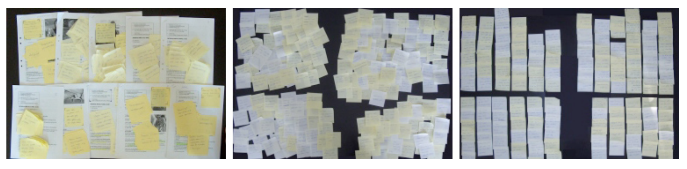
Figure 2. a.) Selected data was taken out as notes from the transcribed data. b.) The notes where sorted in clusters, each being a starting-point for one persona. c.) Affinity diagrams were used to sort out the different interests of each persona.