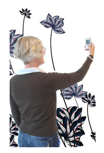
Figure 3. A photo from a camera phone creates a flower on the wall.

While most people change their wallpaper every other year or so, Anne cares for her dynamical wall almost every day. She takes pictures when browsing in trend magazines, or during a stroll in the city, to use for her wall. For each picture that Anne sends to the wall, a flower with specific properties and behavior is created. If Anne adds several pictures, there will be several flowers affecting each other's